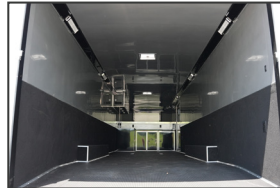
White Vinyl Walls and Ceiling