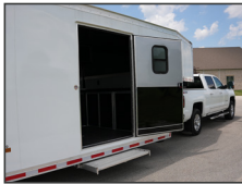
48" Entry Door with Flush Lock