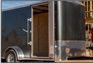
Aluminum Frame Entry Door