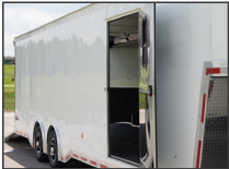
48" Entry Door with Flush Lock